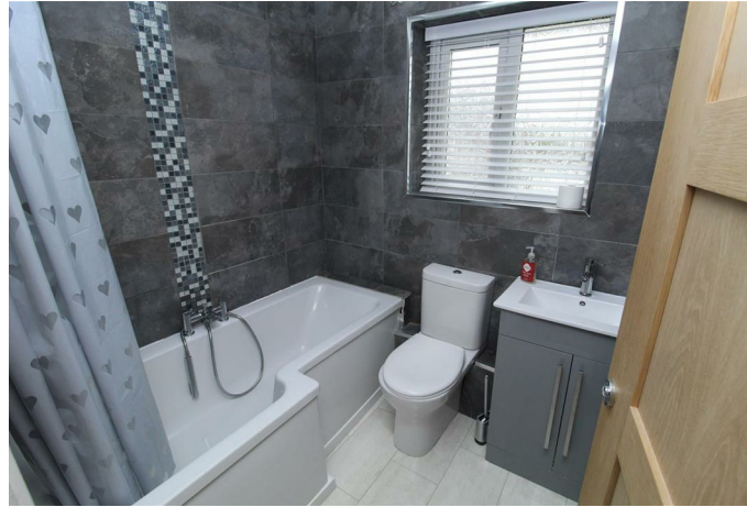
modern white suite comprising; square 'p' shower bath with mains shower over, wash hand basin and low level w.c., chrome heated towel rail, tiled walls, uPVC double glazed frosted window to front aspect