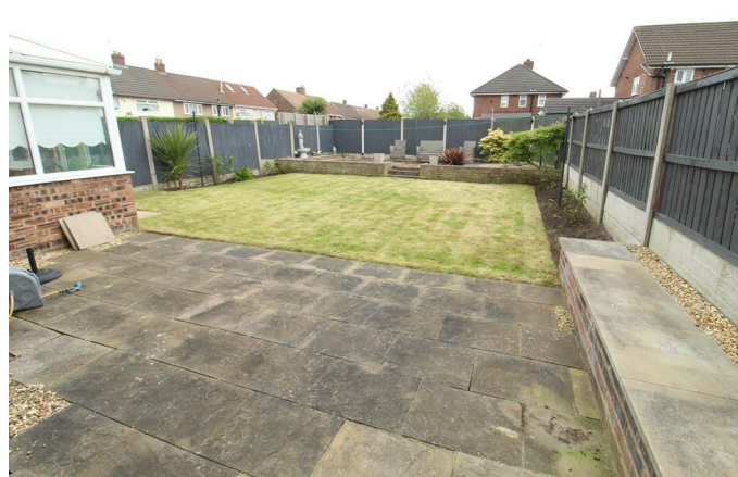
large rear garden laid mainly to lawn with patio areas, access to outbuildings and access to front