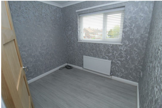
uPVC double glazed window to rear aspect, radiator, laminate flooring