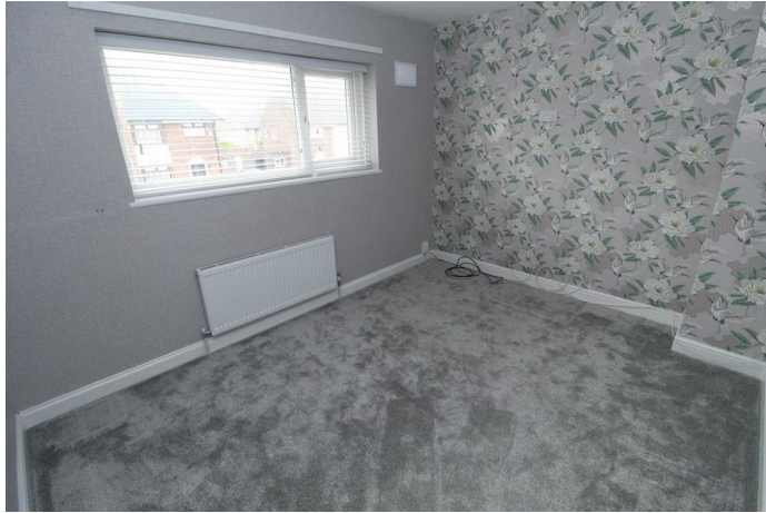
uPVC double glazed window to front aspect, radiator