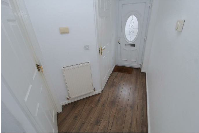
uPVC front door, radiator, laminate flooring, stairs to first floor