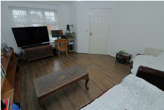
uPVC double glazed window to front aspect, radiator, laminate flooring