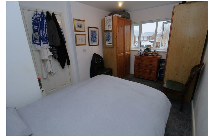
uPVC double glazed window to rear aspect, radiator