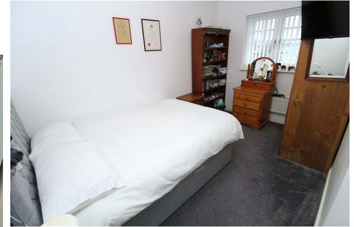
uPVC double glazed window to front aspect, radiator